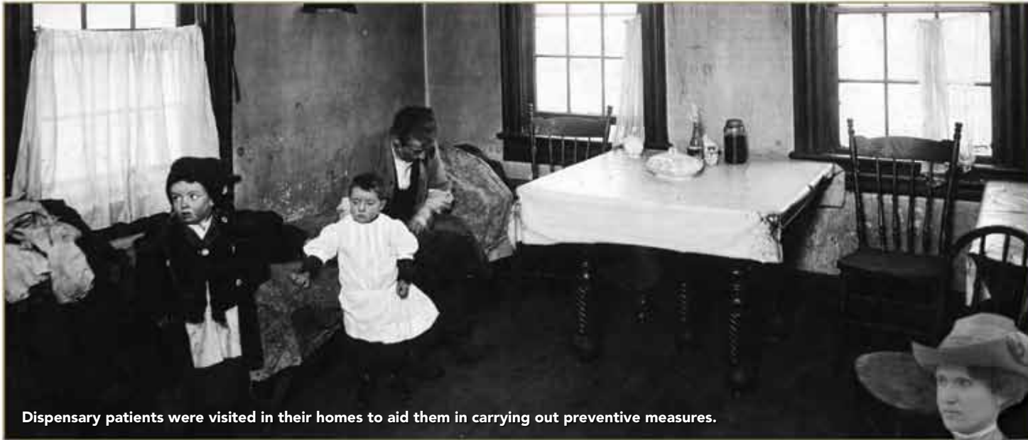
Dispensary patients were visited in their homes to aid them in carrying out preventive measures.