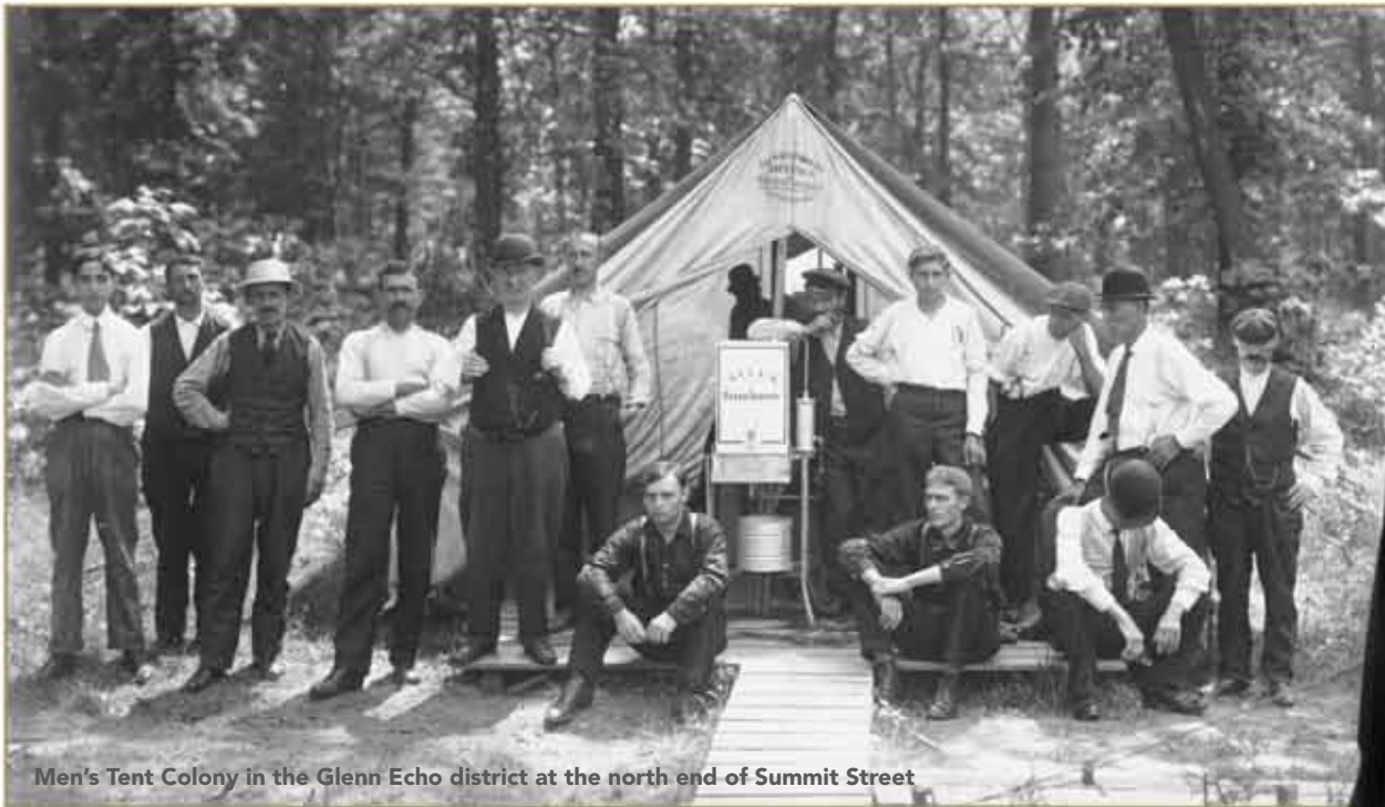
Men's Tent Colony in the Glenn Echo district at the north end of Summit Street