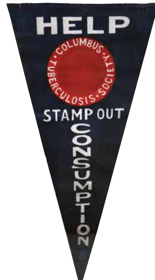
The 1906 Pennant of the Columbus Tuberculosis Society. "Consumption" was the early word used for tuberculosis.